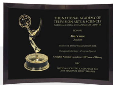
Curved Art Glass $175.00