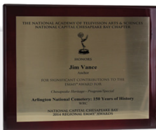
Production Plaque $150.00

Orders are subject to review and approval. 10-1/2" x 13" plaque with engraved plate or personalized life size Emmy statuette.