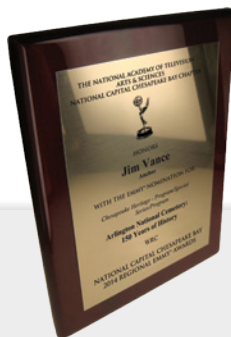
Rosewood Nomination Plaque $125.00

Nominated Entries may order a rosewood plaque (10" x 8") or translucent, curved art glass (10" x 7") personalized with your name and recognizing your work on an Emmy® Nominated work.