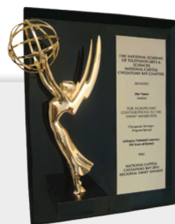
Production Plaque with Statuette $400.00